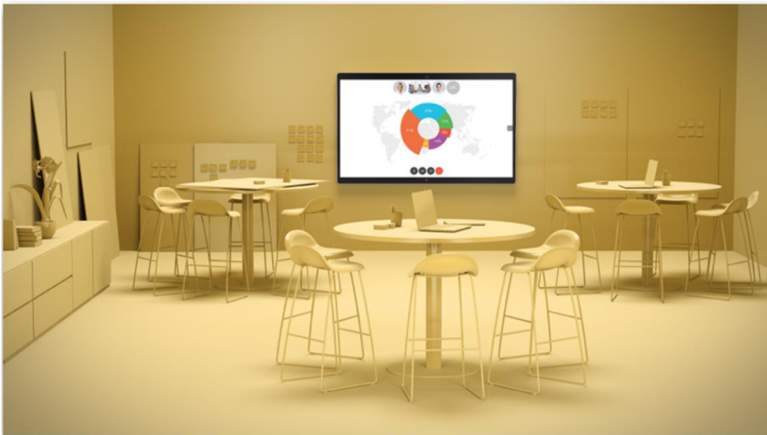
Figure 1. Cisco Webex Board 85 in a large-team environment

* The latest generation Webex Board family may be referred to as the “S Series,” representing some minor optimizations to the hardware platform. Product name remains the same but PID reflects addition of “S” to differentiate from original version for ordering purposes.